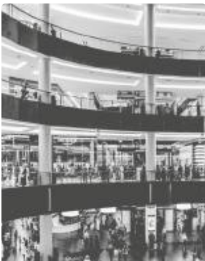
Malls, grocery stores & supermarkets