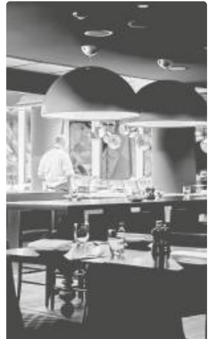
Retail outlets, F&B