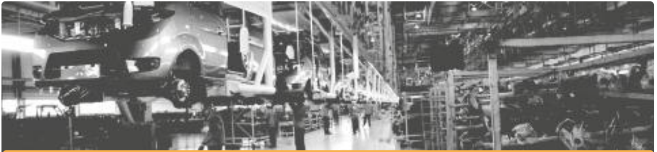
Factories, plants & other industrial sites