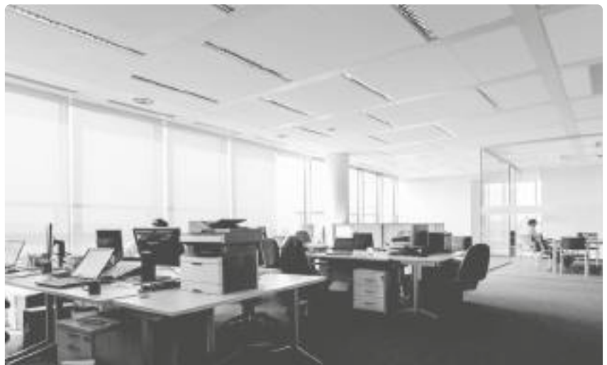
Office buildings & government organizations